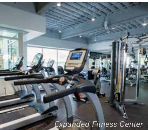
Expanded Fitness Center