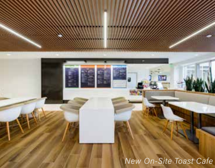
New On-Site Toast Cafe