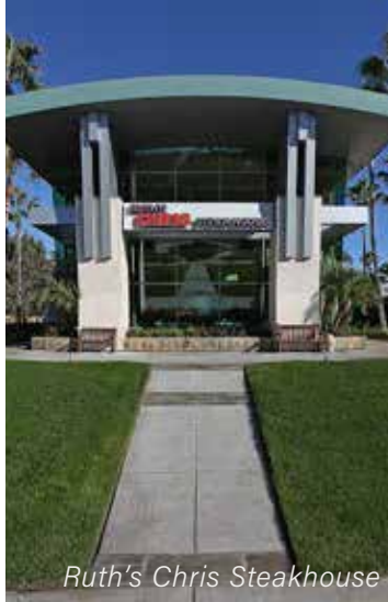
Ruth's Chris Steakhouse